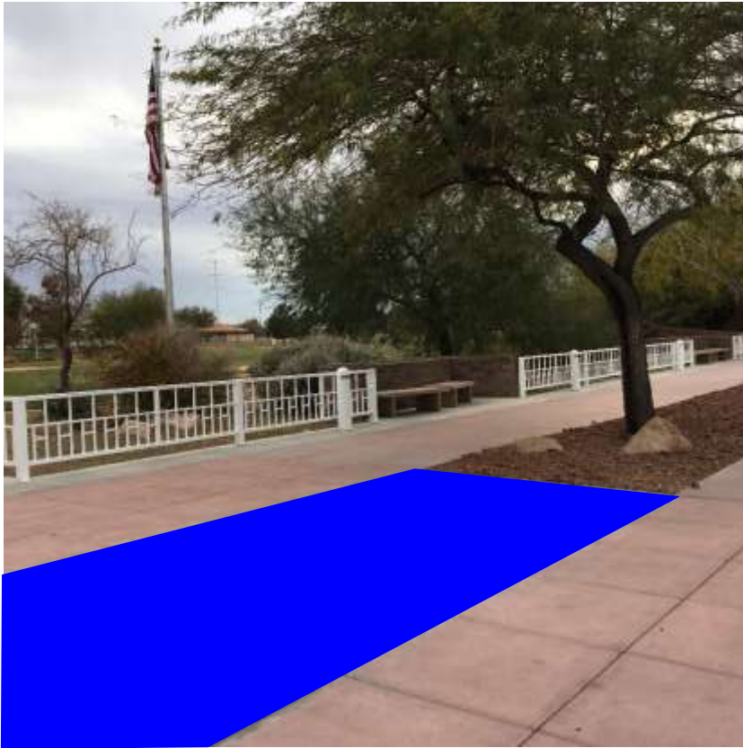
Designated area: Main entrance in front of flag pole under tree