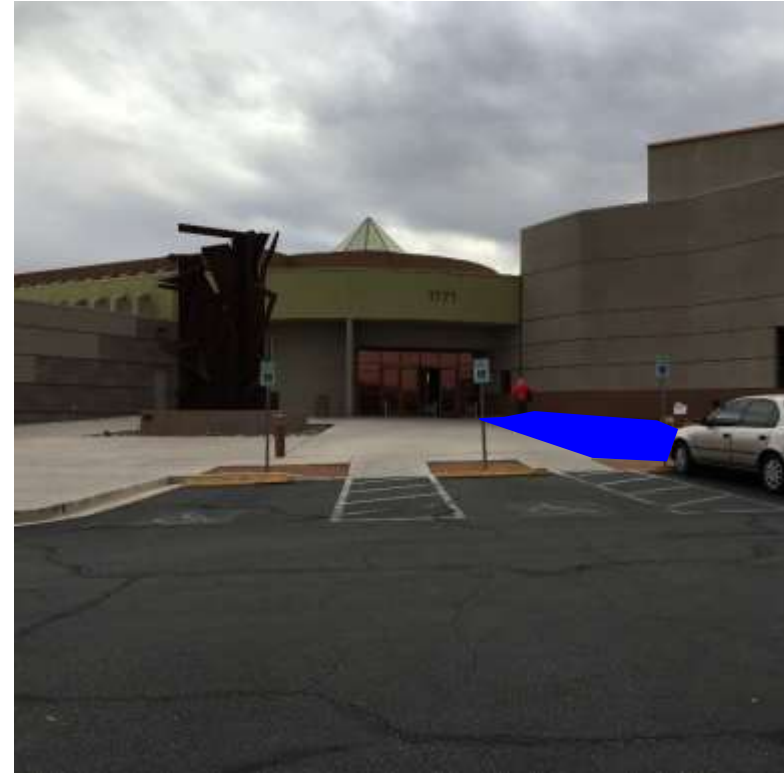
Area 2: North entrance to the west of the sculpture