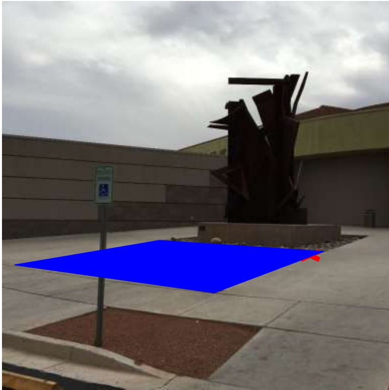
Designated area: North entrance to the east of the sculpture