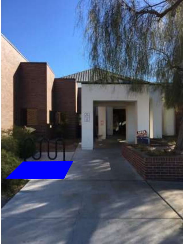
Designated area: Front entrance near the bike rack