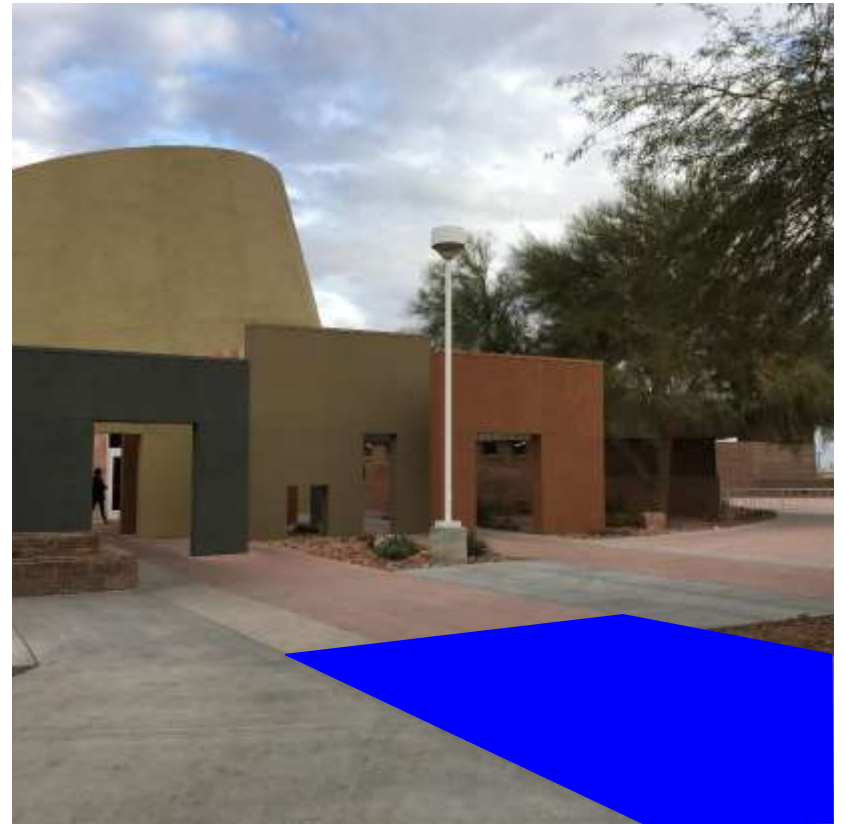
Area 2: Area near tree adjacent to main entrance sidewalk