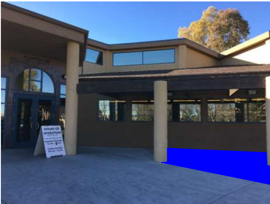
Designated area: 20 feet north of the main entrance