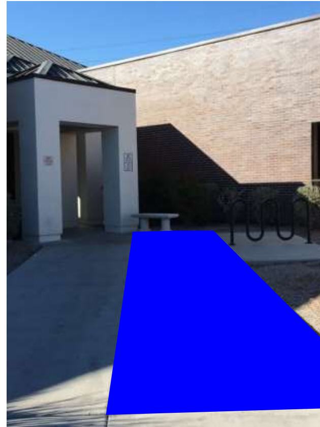
Area 2: Rear entrance near bike rack